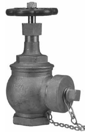
T-331-HC Threaded w/Cap and Chain

* Compliance with the Standard for Hose Valves for Fire Protection Service, UL 668.