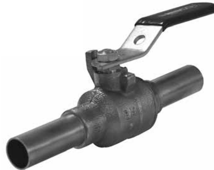
PS585-70-66 Press x Press Male End

600 PSI/41.4 Bar Non-Shock Cold Working Pressure 250°F Maximum Operating Temperature Nominal sizes 1/2" through 1" are UL certified to NSF/ANSI 61 CONFORMS TO MSS SP-110