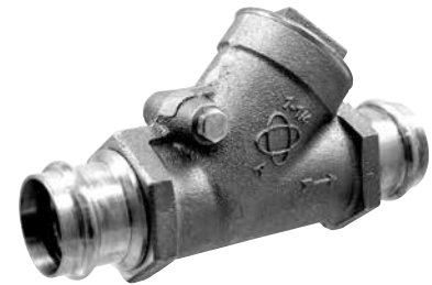
PC413-Y-LF Press Ends