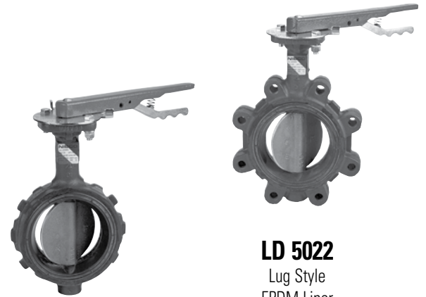
WD 5022 Wafer Style EPDM Liner and Stainless Steel Disc